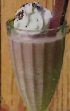
RM 5.50 Mocha