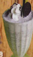
RM 5.50 Oreo