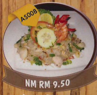
NM RM 9.50 Bee Hoon Singapore Seafood