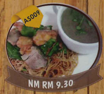
NM RM 9.30 Dry Wantan Noodles with Soup