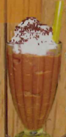
RM 5.50 Cappuccino

All members are entitled to 10% discount on all normal price. All prices are inclusive of 6% GST.