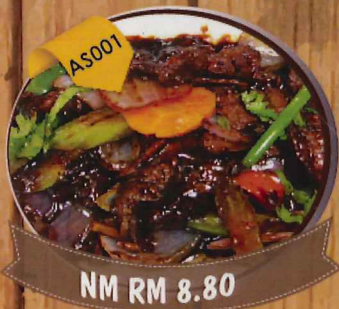
NM RM 8.80 Stir-Fried Black Pepper Beef