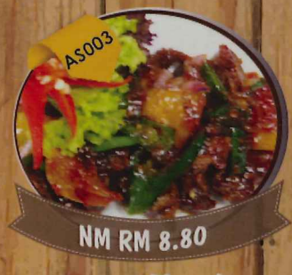
NM RM 8.80 Daging Masak Merah