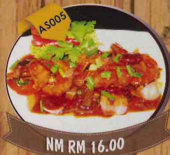
NM RM 16.00 Prawn Dry Chili