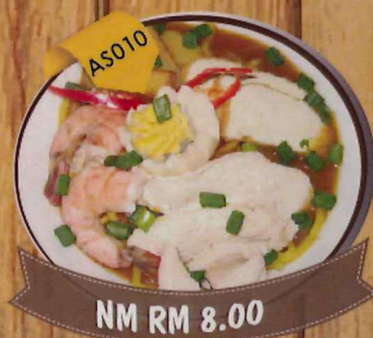
NM RM 8.00 Mee Jawa

All members are entitled to 10% discount on all normal price. All prices are inclusive of 6% GST.