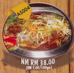
NM RM 38.00 (RM 7.00/100gm) Stir Fried Fish Thai Style