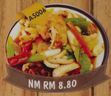
NM RM 8.80 Seafood Paprik