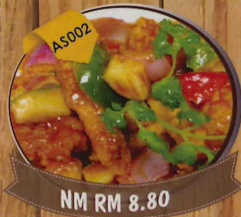
NM RM 8.80 Sweet & Sour Fish