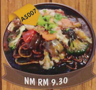
NM RM 9.30 Sizzling Mee or Bee Hoon