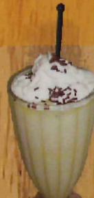
RM 5.50 Apple