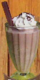
RM 5.50 Chocolate