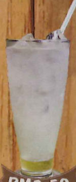
RM3.50 Sour Sop